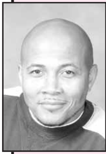
Clerk Craft Director