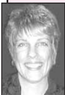
DNDC Facility Director

ments on its' face and challenged the excessing based on the work still being there or non-clerk craft employees performing our work. We took a different approach this time and asked for the precise formula utilized by management to calculate the number of work hours, BPI, and how that equated to reductions in needed employees. What the union uncovered was that the numbers utilized by management were inflated by over 50% and the actual number of employees needed to be excessed was only (19). This number of (19) was derived from their own data. It is time for Detroit Management to stop using Detroit Clerks as the staffing solution for Pittsburgh, the Call Center, or any other office that says "Hey Detroit, can you get us a body?" "Sure we can. Give us a