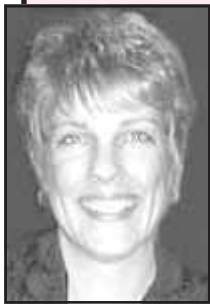
DNDC Facility Director

ments on its' face and challenged the excessing based on the work still being there or non-clerk craft employees performing our work. We took a different approach this time and asked for the precise formula utilized by management to calculate the number of work hours, BPI, and how that equated to reductions in needed employees. What the union uncovered was that the numbers utilized by management were inflated by over 50% and the actual number of employees needed to be excessed was only (19). This number of (19) was derived from their own data. It is time for Detroit Management to stop using Detroit Clerks as the staffing solution for Pittsburgh, the Call Center, or any other office that says "Hey Detroit, can you get us a body?" "Sure we can. Give us a