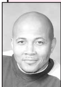
Clerk Craft Director