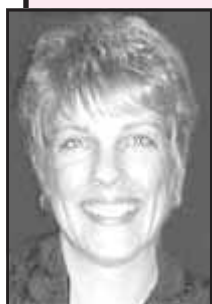
DNDC Facility Director

ments on its' face and challenged the excessing based on the work still being there or non-clerk craft employees performing our work. We took a different approach this time and asked for the precise formula utilized by management to calculate the number of work hours, BPI, and how that equated to reductions in needed employees. What the union uncovered was that the numbers utilized by management were inflated by over 50% and the actual number of employees needed to be excessed was only (19). This number of (19) was derived from their own data. It is time for Detroit Management to stop using Detroit Clerks as the staffing solution for Pittsburgh, the Call Center, or any other office that says "Hey Detroit, can you get us a body?" "Sure we can. Give us a