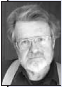
Clerk Craft Director